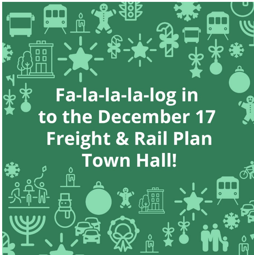
FIGURE 2.3 SAMPLE SOCIAL MEDIA POSTS