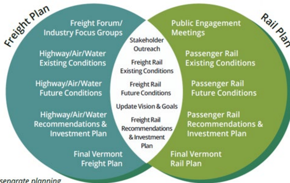
FIGURE 1. 1 VERMONT FREIGHT AND RAIL PLAN ELEMENTS

Although two separate planning efforts, the Freight and Rail Plans share common tasks and work products.