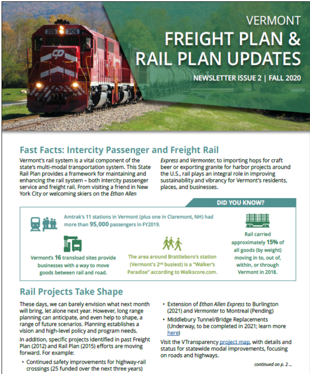
FIGURE 2.2 NEWSLETTER ISSUE 2 EXAMPLE