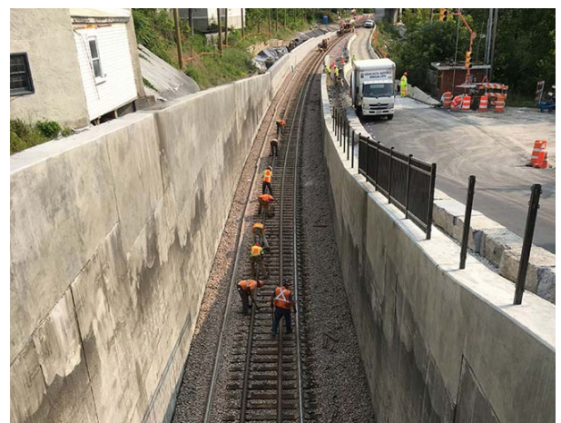
Many are excited that the Middlebury Rail & Tunnel project is on schedule to wrap up in 2021. It is important to consider smaller-scale initiatives as well to be realistic in the Rail Plan.

Stay tuned for the draft tech memo, published on the web page . We'll explore details of the table and a short set of initiatives in the next newsletter and round of outreach. The final table will be in the Rail Plan.