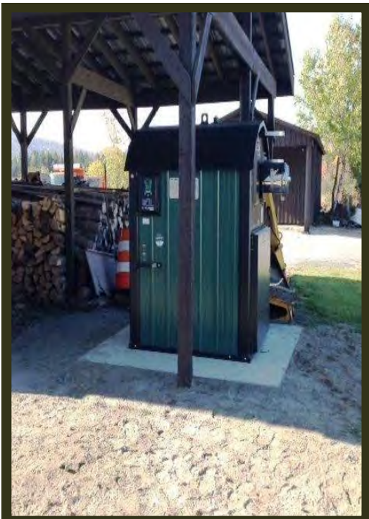
New Wood Burner - Island Pond