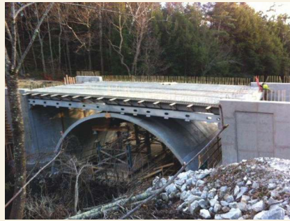
Middlebury Sand Hill Bridge legacy project in 2014.

Several projects within the Vermont Agency of Transportation had been on the books since the early 1980s. Many of these projects were put on hold because of public opposition due to impacts from traditional construction methods. Often, other conventional solutions were proposed, only to be met with more disapproval due to community concerns over project impacts and traffic management strategies. This created significant inefficiencies including lengthy schedule delays and increased costs for these legacy projects.