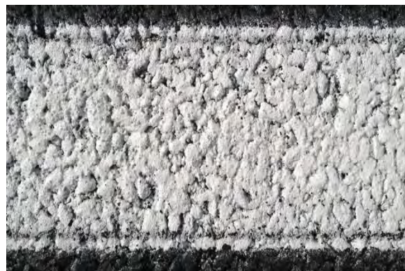
Figure 4: White Edge Line.