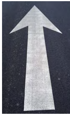
Figure 1: ATM 400 Arrow.

The site has been visited monthly since installation. Figures 1 and 2 depict the markings below. Table 1 below summarizes these results.