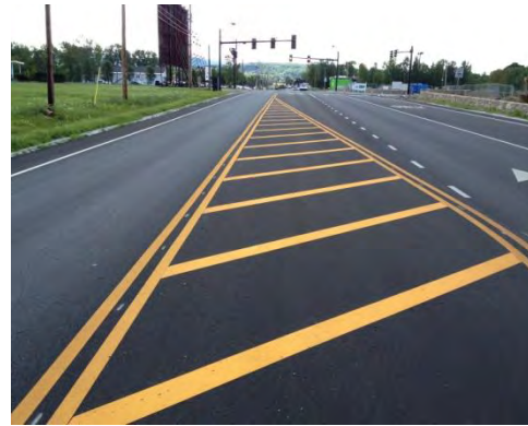
Figure 2: Brite-Line Gore Marking and Long Line Markings.