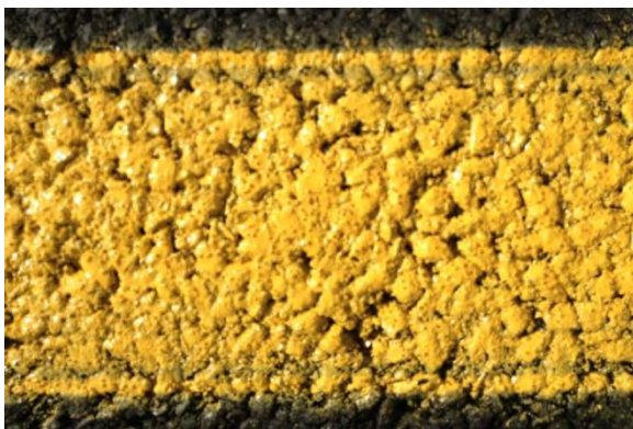
Figure 3: Yellow Edge Line.

The markings are shown in Figures 3 and 4 below.