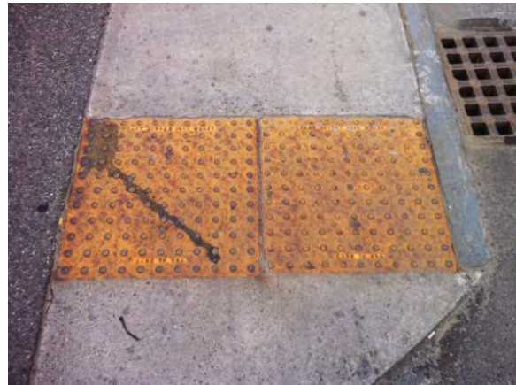
Figure 4-5: East Jordan Works – Detectable Warning Plates 2013

Neenah Foundry Co.: Unpainted Cast Iron Panels