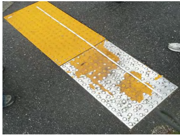
Figures 8-9: MetaDome, LLC. – Asphalt. 2009