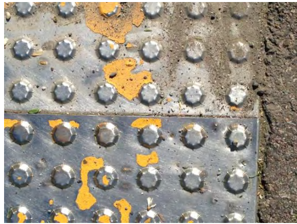
Figures 10-11: MetaDome, LLC. – Asphalt. 2013