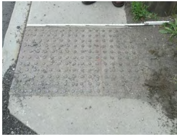
Figure 3: East Jordan Works – Detectable Warning Plate in 2009