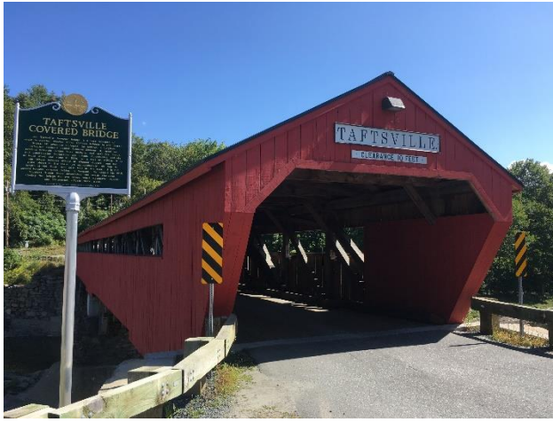
Front view of the Taftsville covered bridge on Town Highway 2, Woodstock VT.