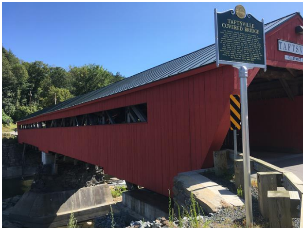
The top photo shows the overall view of the Northside wall of Bridge 45 looking towards the east, while the bottom photo shows the same Northside wall of the bridge, only looking towards the west.