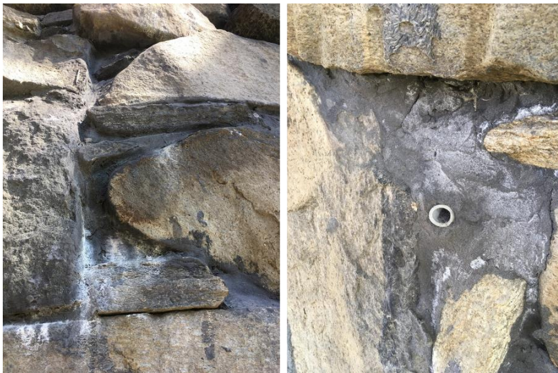
Both the photos are close-up views of the west wall of the east abutment. Both photos show the powdery residue (chlorides) leeching out of the mortar, but the right photo also shows PVC tubes that aid in the draining of moisture within the east end abutment. It was noted that the mortar on the west wall of the east abutment was a darker grey.