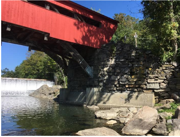
Overall view of the east end abutment of Bridge 45.