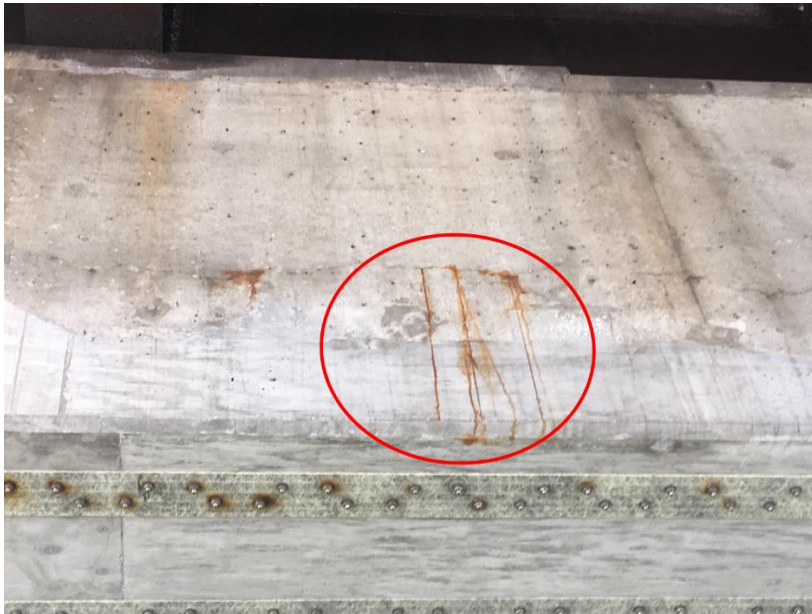
Close-up of a crack on the front face of the horizontal member near the mid-span of the North end bent on the southbound lane of Bridge 98. What looks like rust can be seen dripping out of the crack (seen within the red circle), which means that moisture has entered the crack and has started corroding the reinforcing steel within the concrete bent.