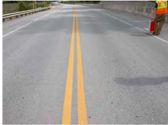
Figure 4 Test site 1 – August 23, 2005

It has been shown through previous research that retroreflectivity readings typically decrease from application into the winter maintenance season, yet rebound in the spring or summer of the next year as the road is cleaned. The tables below show this pattern with the increase in the retroreflectivity values for May to August. This compares favorably with roads with similar traffic volumes surveyed in previous studies. The average white edge line readings for both the Tuffline and SG 70 thermoplastic were above the FHWA recommendation of 100 mcdl. Both materials were also above the FHWA recommended value of 80 mcdl for yellow lines which is within serviceable limits.