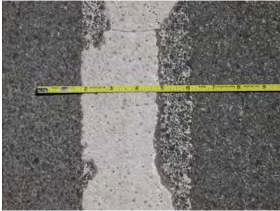
Figure 3 Test site 3 – May 12, 2005

for SG 70. (Appendix A & B). Durability ratings fell to an average of 6 which remains in the “fair” to “good” range.