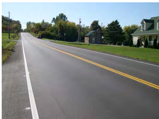
Figure 1 Test site 3 –Oct. 7, 2004

Southbound white edge lines as well as both the Northbound and Southbound yellow center lines. Test sites 1, 2, and 3 are the experimental Tuffline hydrocarbon by Crown Technology, LLC. Test site 4 is the “control” Thermoplastic, Stud-Guard SG 70 by Ennis Paint. Initial retroreflectivity was sampled on October 7, 2004, with readings taken on this day averaging 368 mcdl for the Tuffline and 455 mcdl for the SG 70 white lines. The readings on the yellow lines averaged 152 mcdl for the Tuffline and 179 mcdl for the SG 70 (see Appendix A & B). The durability rating on a scale from 1 to 10 was 10 for both the white and yellow lines. The durability rating is gathered according to ASTM D713-90, Standard Practice for Conducting Road Service Tests on Fluid Traffic Marking Materials along with ASTM D913, Standard Method for Evaluating the Degree of Resistance to Wear of Traffic Paint.