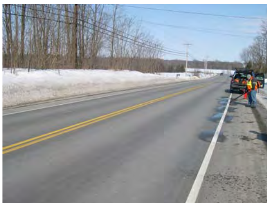
Figure 2 Test site 2 – March 14, 2005 (Cleaning of lines evident)

After five months of service, a second set of readings were taken on March 14, 2005. Winter cleaning protocol (see Appendix C) was carried out to insure that the lines were clear of salt and dirt from snow removal and salting operations. This can be seen in Figure 2 above. The readings collected at this time on the white edge lines averaged 127 mcdl on the Tuffline markings and 135 mcdl for the SG 70 markings. All data sampled can be seen in Appendix A. The yellow lines were not sampled at this time.