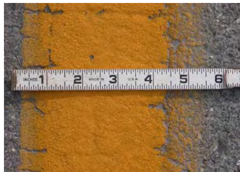
Figure 2 – XSR Yellow Center Line

Observations with regards to relative humidity, temperature, wet mil thickness and approximate dry time was recorded for both the experimental and control markings. It should be noted that while the associated Category II work plan called for a wet thickness of 15 mils, an uneven surface roughness prevented a consistent application thickness. Actual wet thicknesses appeared to range from 10 to 20 mils. This will have an effect on the overall observed drying time as a thinner line is expected to dry more quickly while a thicker line is suspected to dry more slowly. Please note however, that all wet mil thicknesses in relation to dry time were recorded. Table 1, depicting the relationships between marking type, dry time, ambient air temperature and relative humidity is provided below.