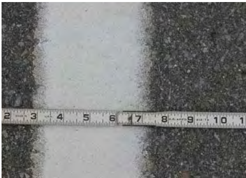
Figure 1 – XSR White Edge Line

Following application and proper dry time, the overall appearance of the experimental paint markings appeared to be much better in comparison to the standard waterborne paint as the cold weather paint retained a consistent texture and greater dry thickness. Figures 1 and 2, as provided below, depict the white and yellow experimental markings following sufficient dry time.