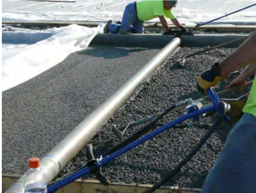
Figure 2. Placement and rolling of porous concrete.

left. The plastic sheeting, used for curing, is also beginning to be placed over the slab on the far left.