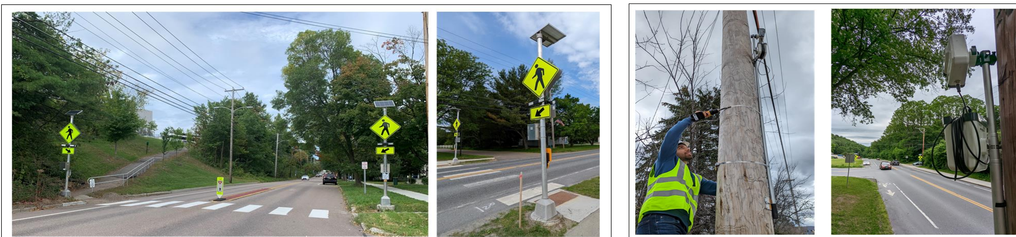
Figure 1. Example of RRFB location and treatment (left). A camera set up for data collection (right).

Rectangular Rapid Flashing Beacons (RRFBs) are designed to improve safety by increasing drivers' awareness of pedestrians in mid-block crossings using a pedestrian-activated signal. However, little is known about their effectiveness in rural contexts, and it has been suggested that they may increase risky crossing behavior by pedestrians who assume that motorists are responsive to the beacon. This study evaluates the effects of RRFBs on driver and pedestrian compliance and risky behaviors compared with traditional mid-block crossings without RRFBs. We evaluate these outcomes in Vermont's rural context, including small cities, villages, and town centers and rural/urban transition zones.