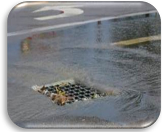
Photo: Road stormwater collection