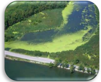
Photo: Algal Bloom