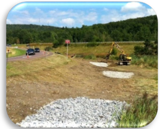
Photo: St. Albans I-89 Median Stormwater Retrofit